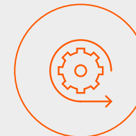
Local Operating Model