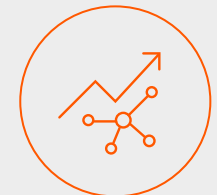
Advanced Analytics & Intelligent Automation

“Professional Services appears to be approaching a tipping point as disruptive technologies drive fundamental changes in the industry’s economics.”